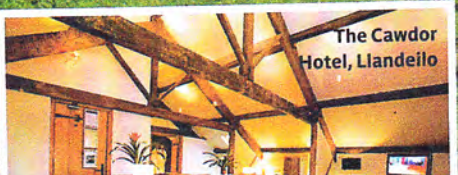
The Cawdor Hotel, Llandeilo